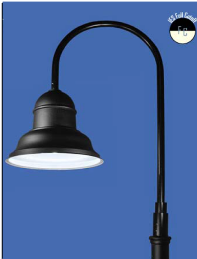
Proposed LED Trail lights