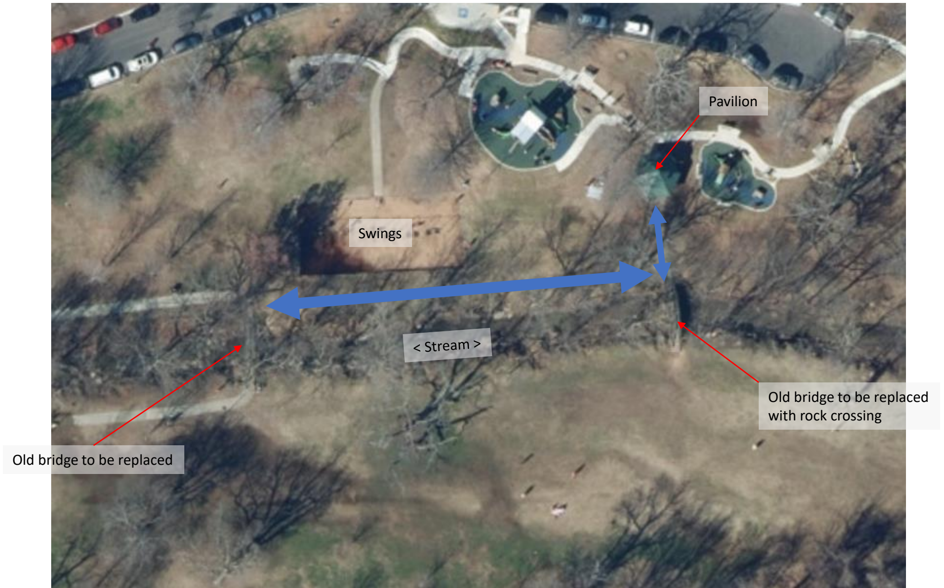
Wilson Community Park – Aerial of Work Area Fayetteville, Arkansas

The new trail/promenade will be an amenity increasing the value of the park to citizens. It will provide ADA access from the walking trail to the playground and pavilion, and allows citizens to better view and interact with the stream.