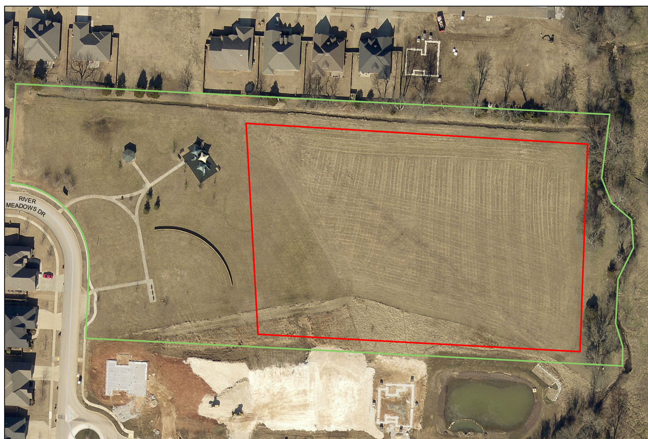
Rodney Ryan Park Approximately 3.5 acres