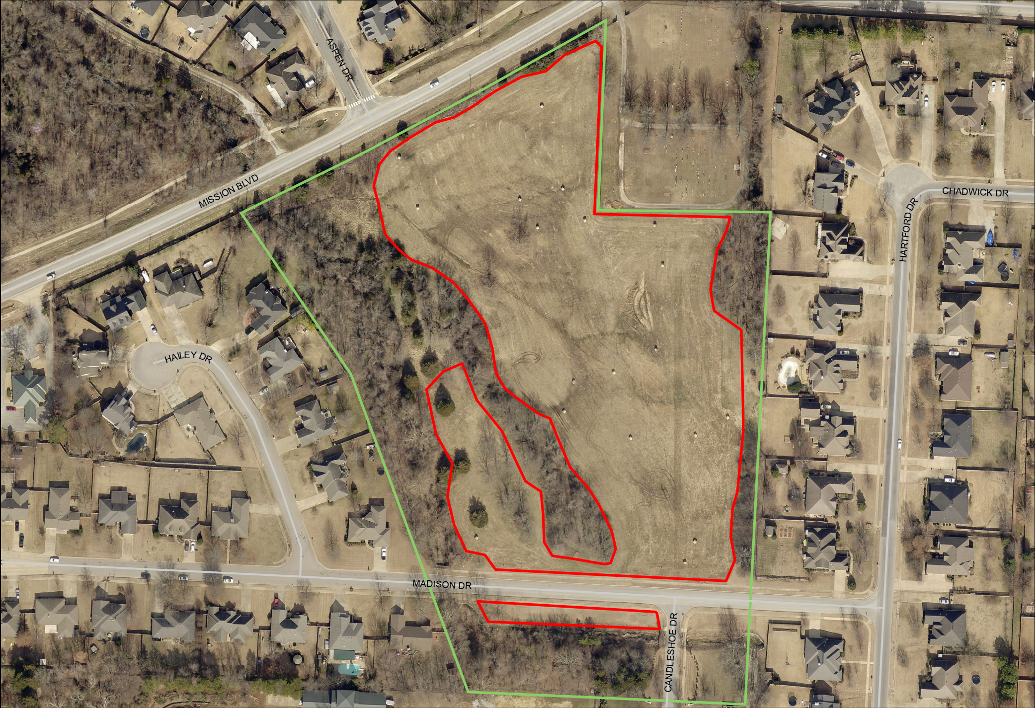
Madison Natural Area Approximately 7 acres