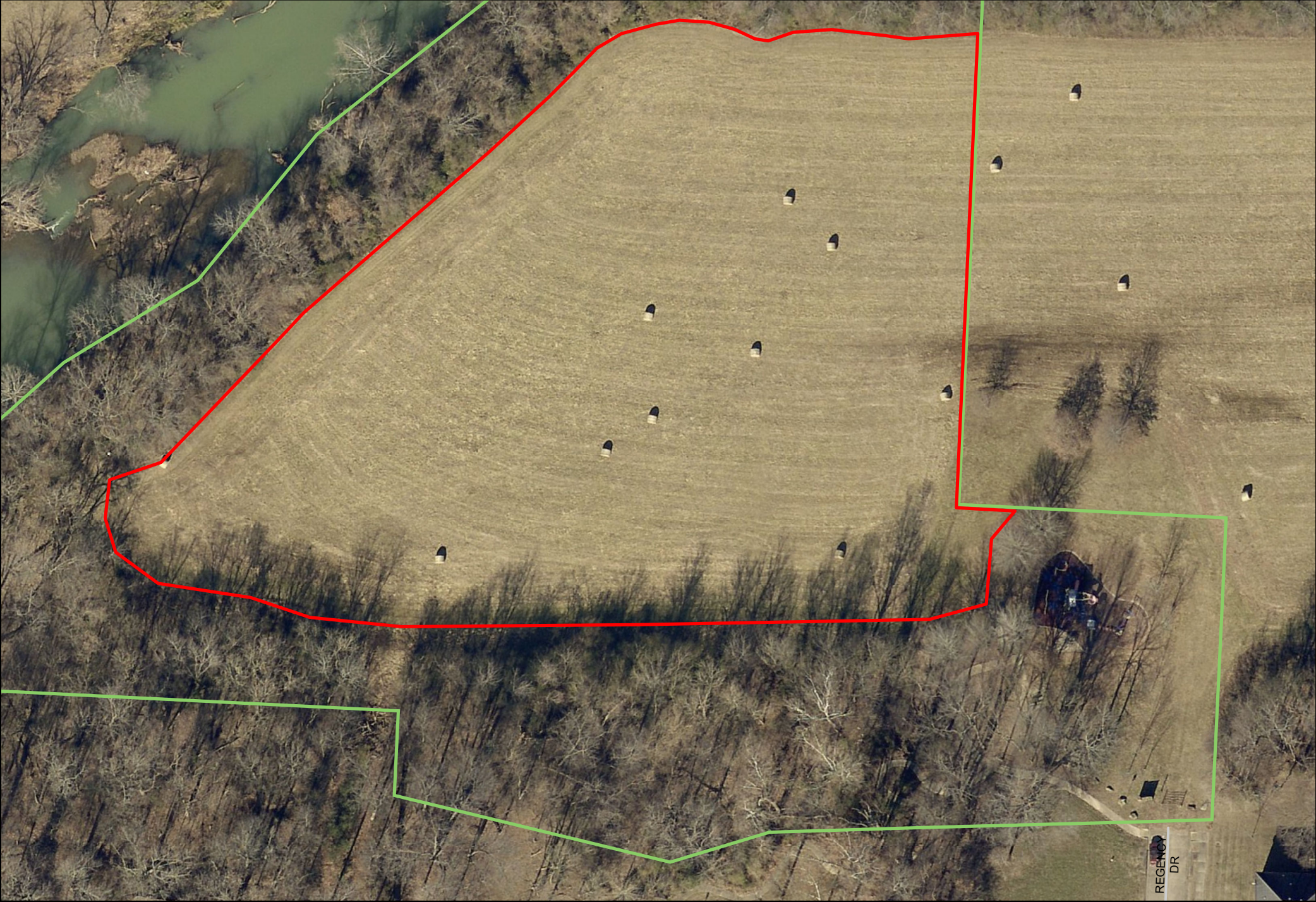
Exhibit A: 3 Bayyari Park Approximately 3 acres