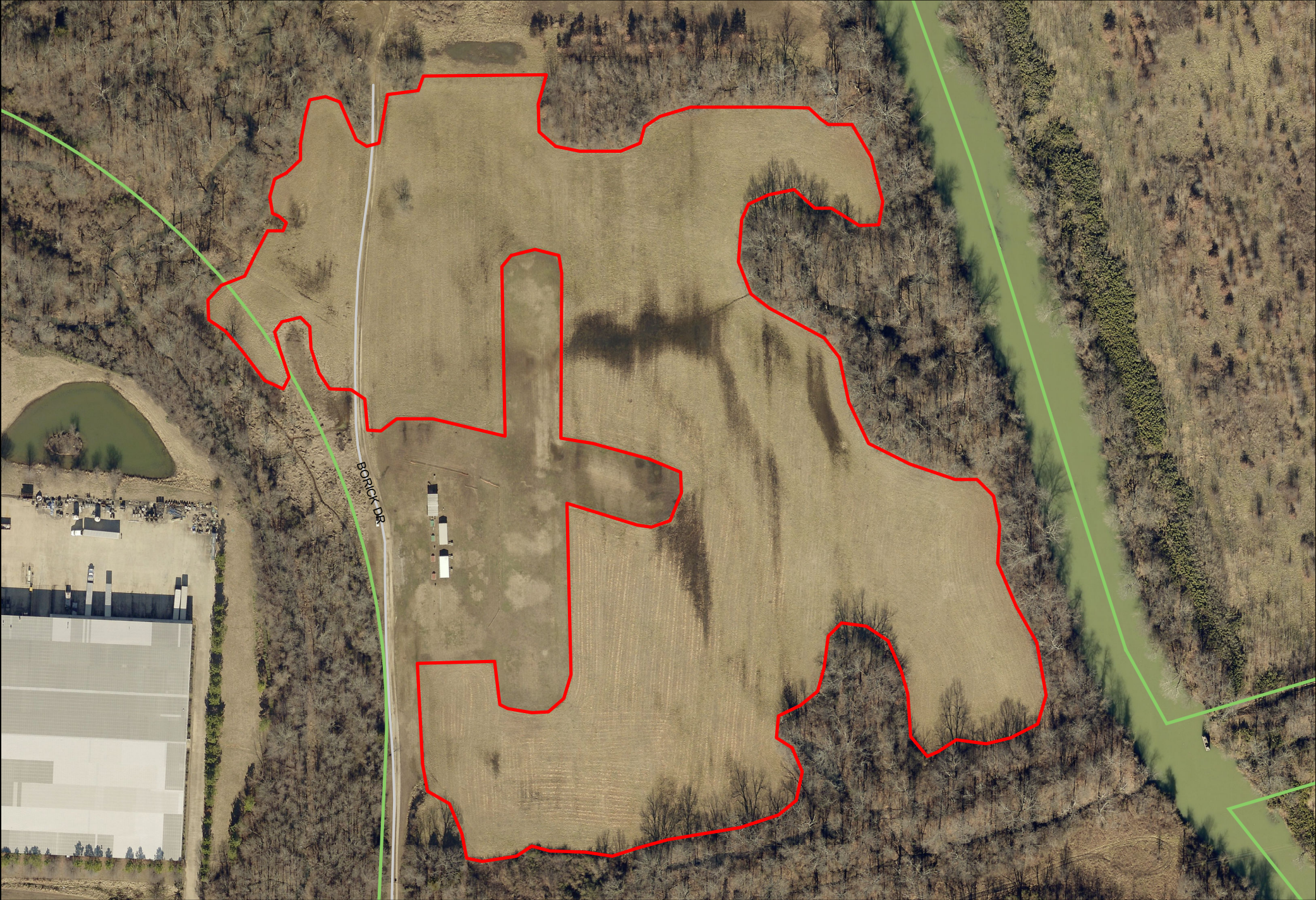
Combs Park Approximately 17 acres