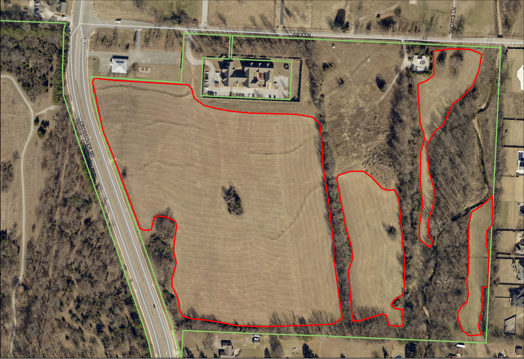
Lake Fayetteville - Crossover Rd & Ivey Ln Approximately 24 acres