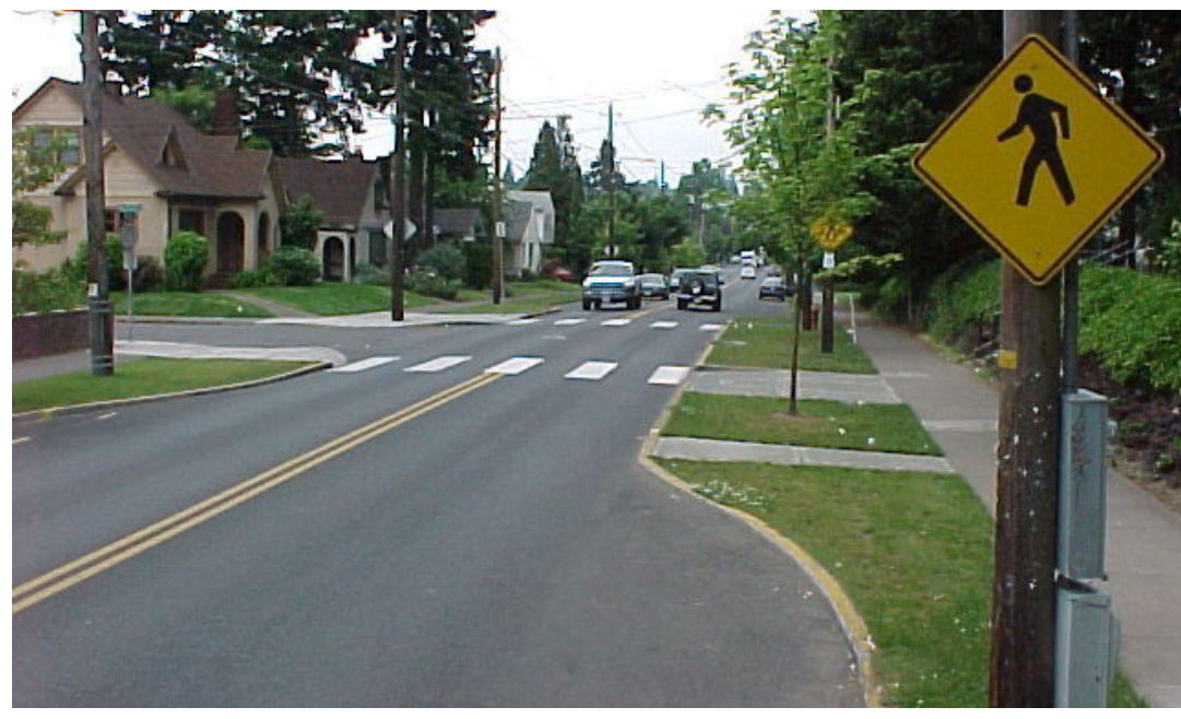
22 PEDESTRIAN BUMP-OUTS