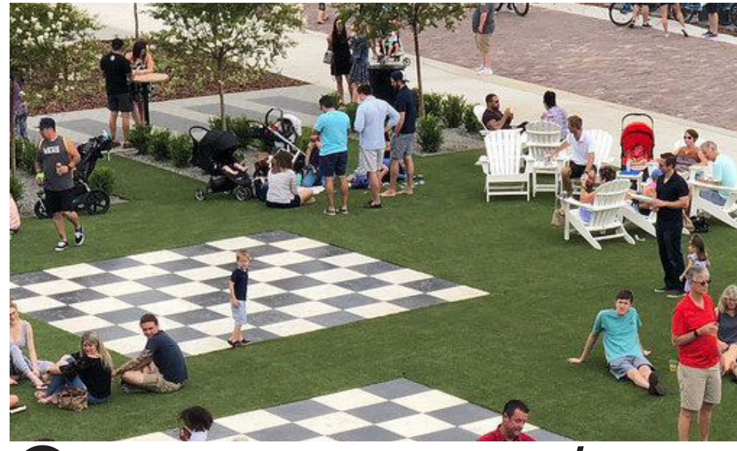
16 OUTDOOR LOUNGE/ GATHERING PLAZA (WITH YARD GAMES)