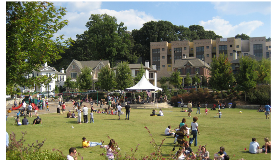
5 OPEN LAWN