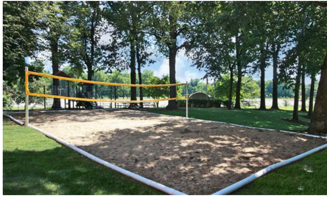
7 VOLLEYBALL COURTS