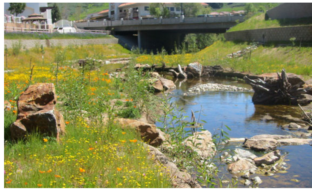
26 STREAM RESTORATION + EDUCATION AREA