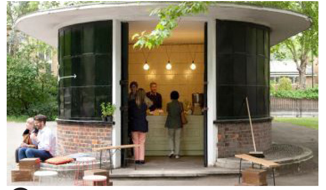
18 CONCESSIONS + RENTAL BUILDING