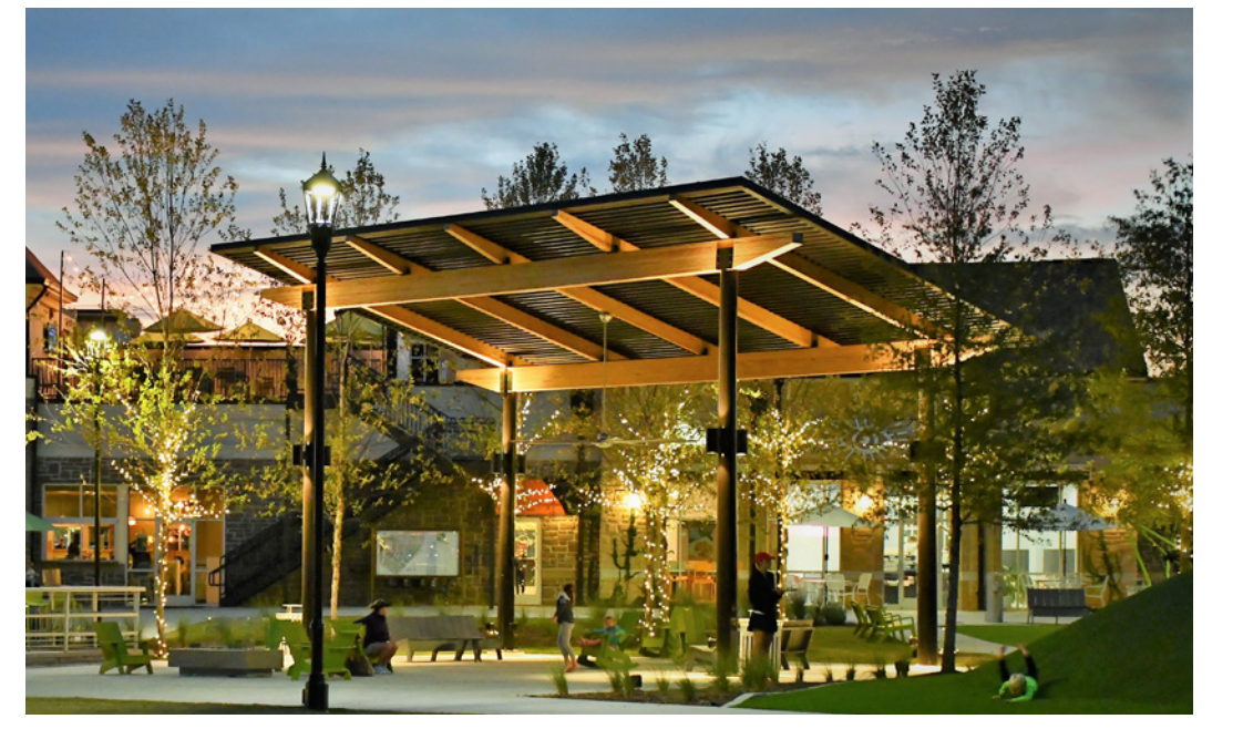
21 LARGE PAVILION