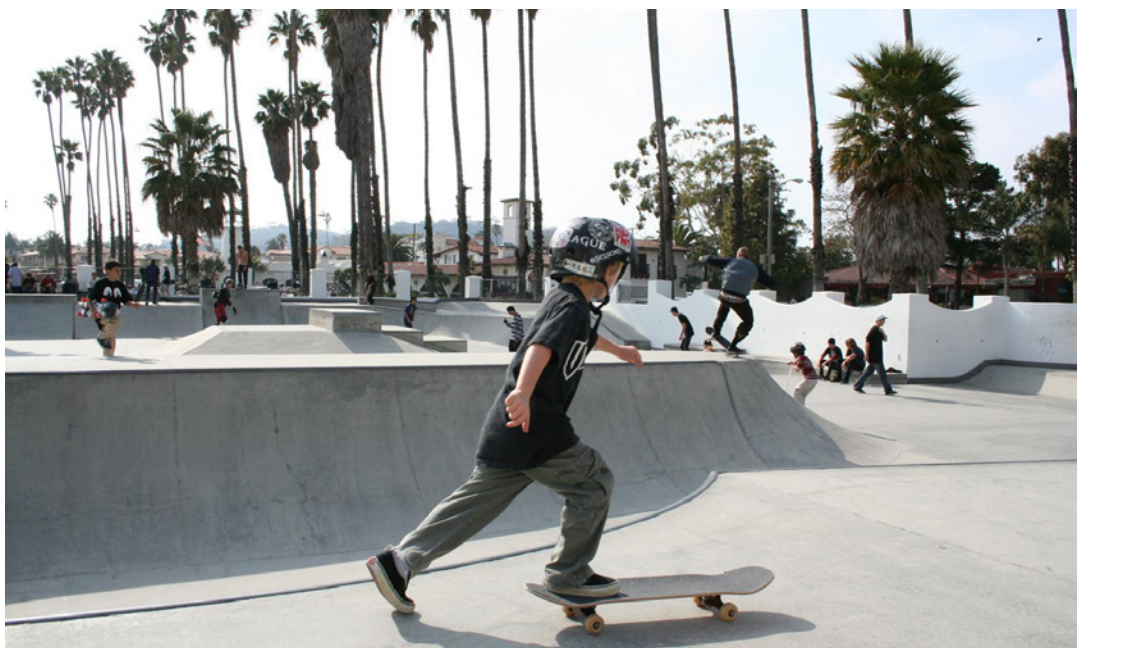
29 EXPANDED SKATEPARK