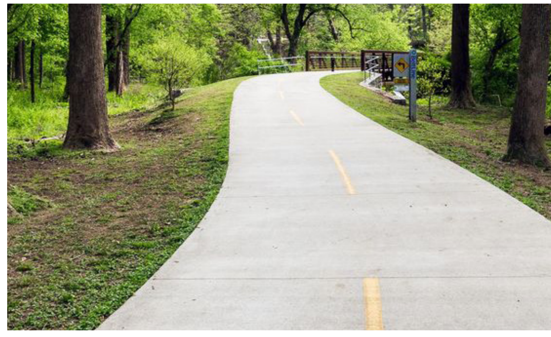
19 NEW WALKING TRAIL