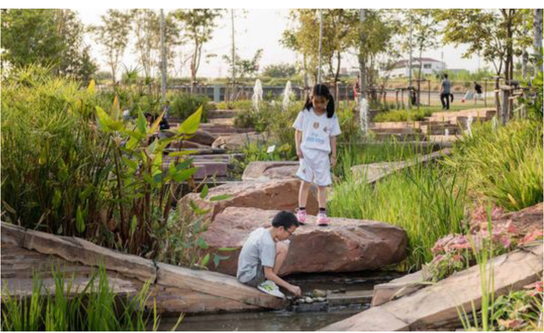
36 INTERACTIVE PLAY AREA AT CREEK