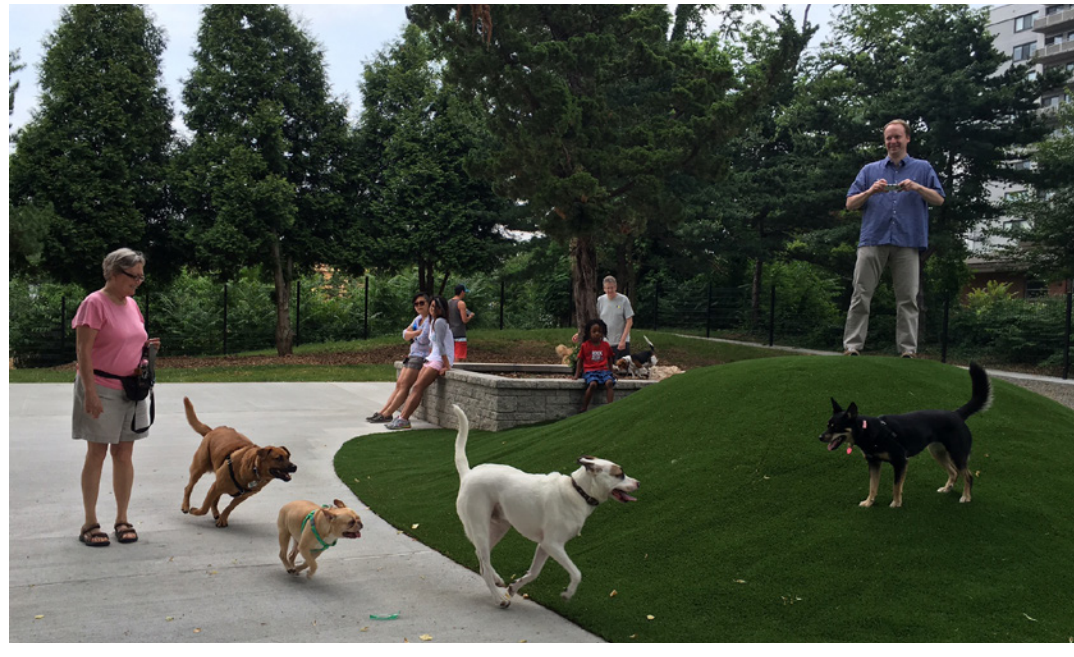
14 15 DOG PARK