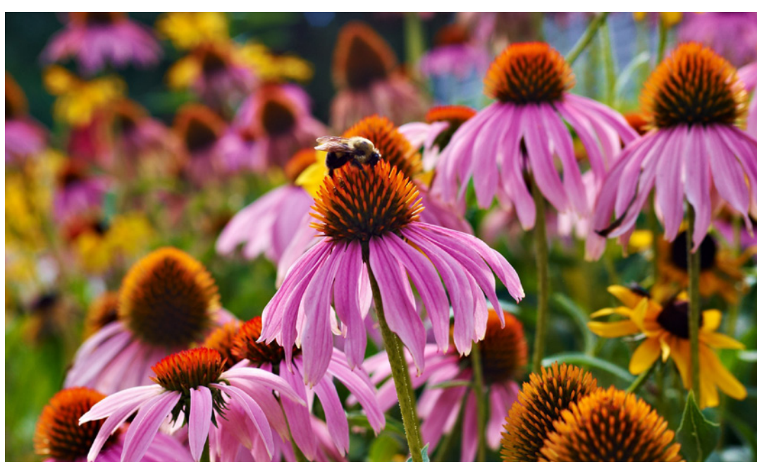
37 NATIVE PLANTINGS - REVEGETATION AREA