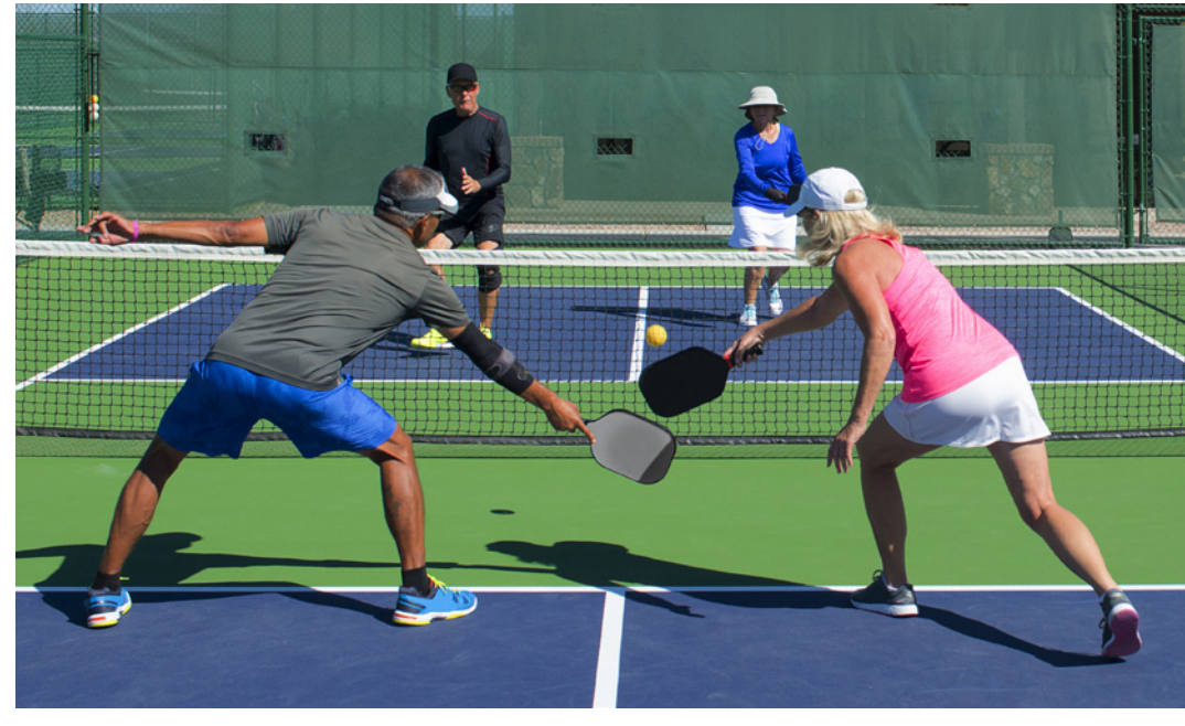
9 PICKLEBALL COURTS