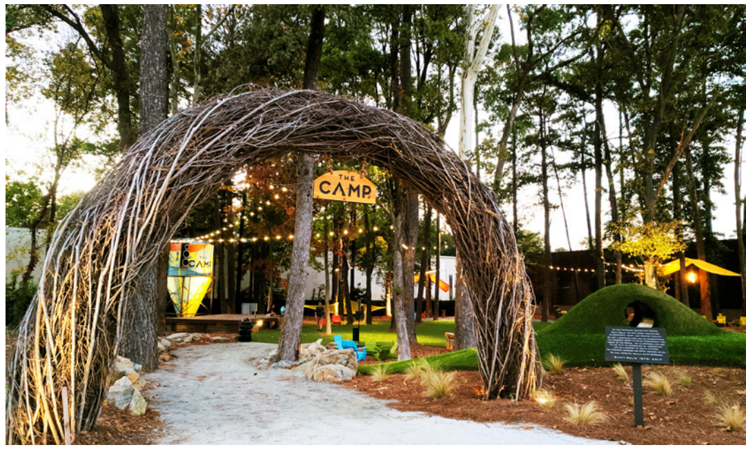
1 ENTRY GATEWAY