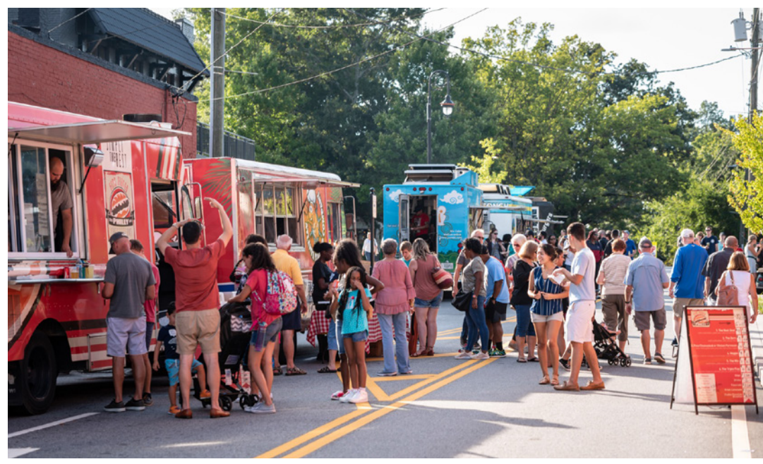
31 FOOD TRUCK PARKING