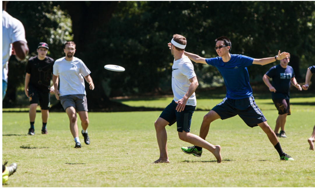
6 MULTI-USE FIELDS