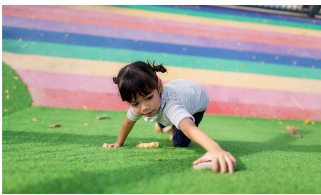
35 BOULDERING / CLIMBING AREA