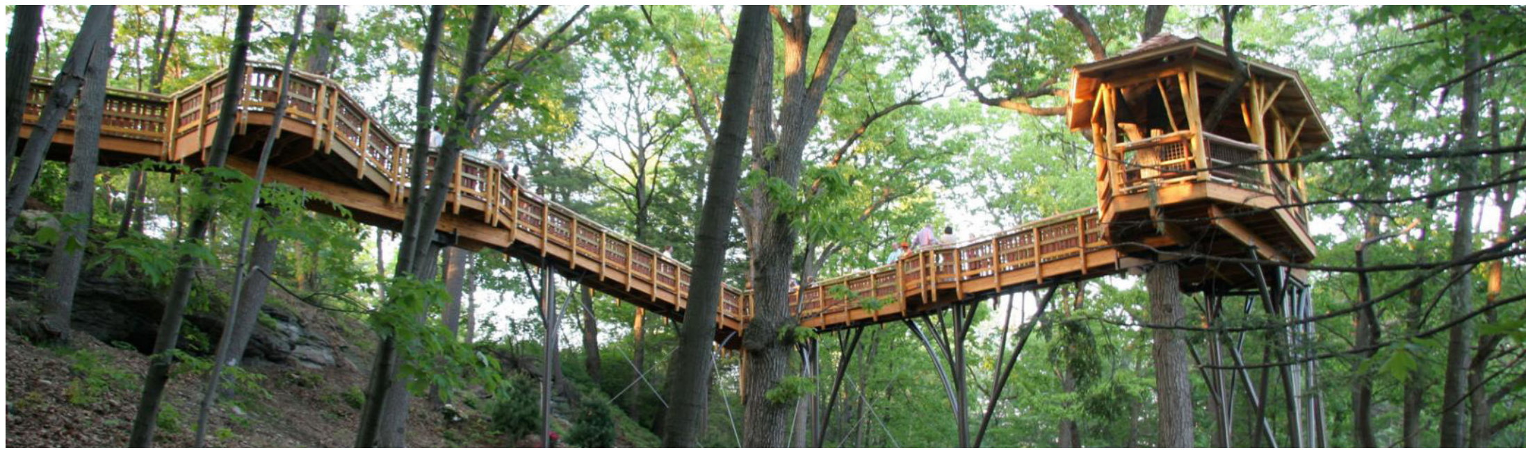
17 ADVENTURE ZONE/TREETOP QUEST