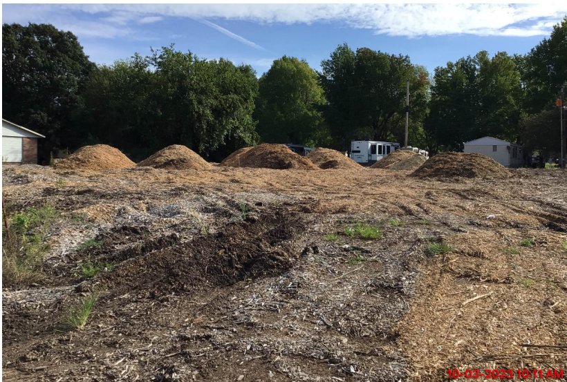
Staff Investigation Photos September & October 2023