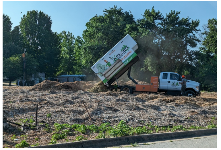
Resident-Provided Site Photos (Non-Date Specific)